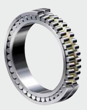
NKE spherical roller bearing