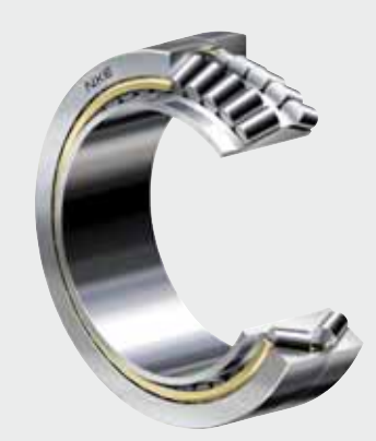
NKE tapered roller bearing

NKE full compliment cylindrical roller bearing (without cage)